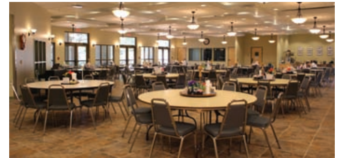
ARMY RESIDENCE COMMUNITY

The Army Residence Community accommodates the needs of 650 retired career military officers, their spouses, widows, and widowers in a 30 acre development. It includes amenities such as duplex cottages, assisted living facilities, theater, medical and dental clinic, banking annex, convenience store, and an informal dining area.