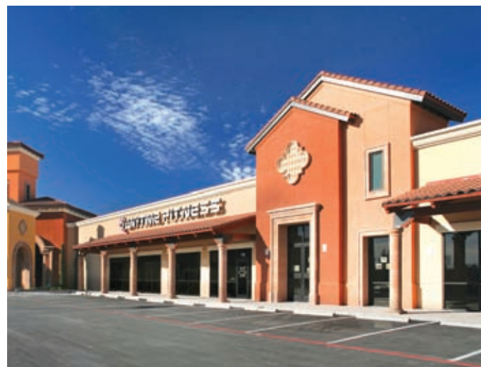
VALENCIA VILLAGE DE INWOOD

This upscale retail center in San Antonio features tilt-wall panels accented with Mexican hand-carved stone columns, Spanish tile roofing and heavy timber wood, making it a beautiful and uniquely designed project.