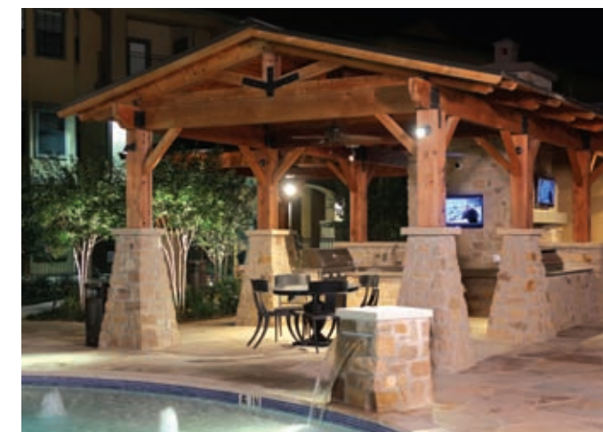
THE VILLAS AT SUNDANCE

This Class-A luxury, high-density urban infill apartment community located in Houston, Texas, features resort-like amenities including landscaped courtyards, pools with large sunning decks and outdoor kitchens. In the clubhouse, residents enjoy an Internet café and coffee bar, billiards and poker room, as well as indoor tanning facilities.