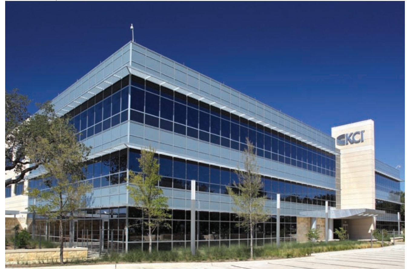
KCI GLOBAL HEADQUARTERS