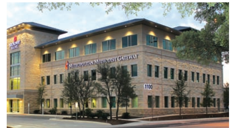
METROPOLITAN METHODIST GATEWAY

Linear Accelerator for US Oncology located in the Methodist Center on Medical Drive building in the San Antonio, Texas Medical Center.