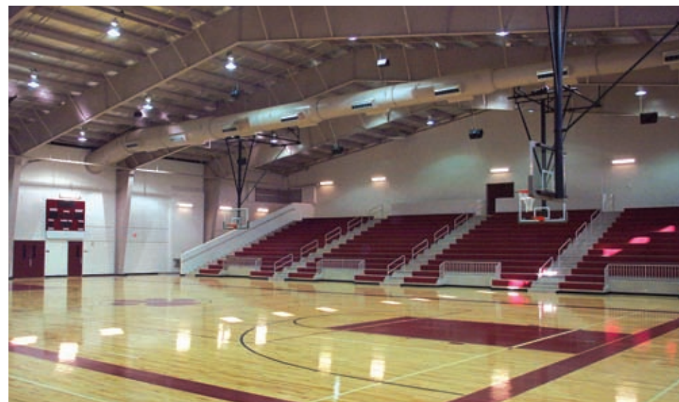
FLORESVILLE HIGH SCHOOL