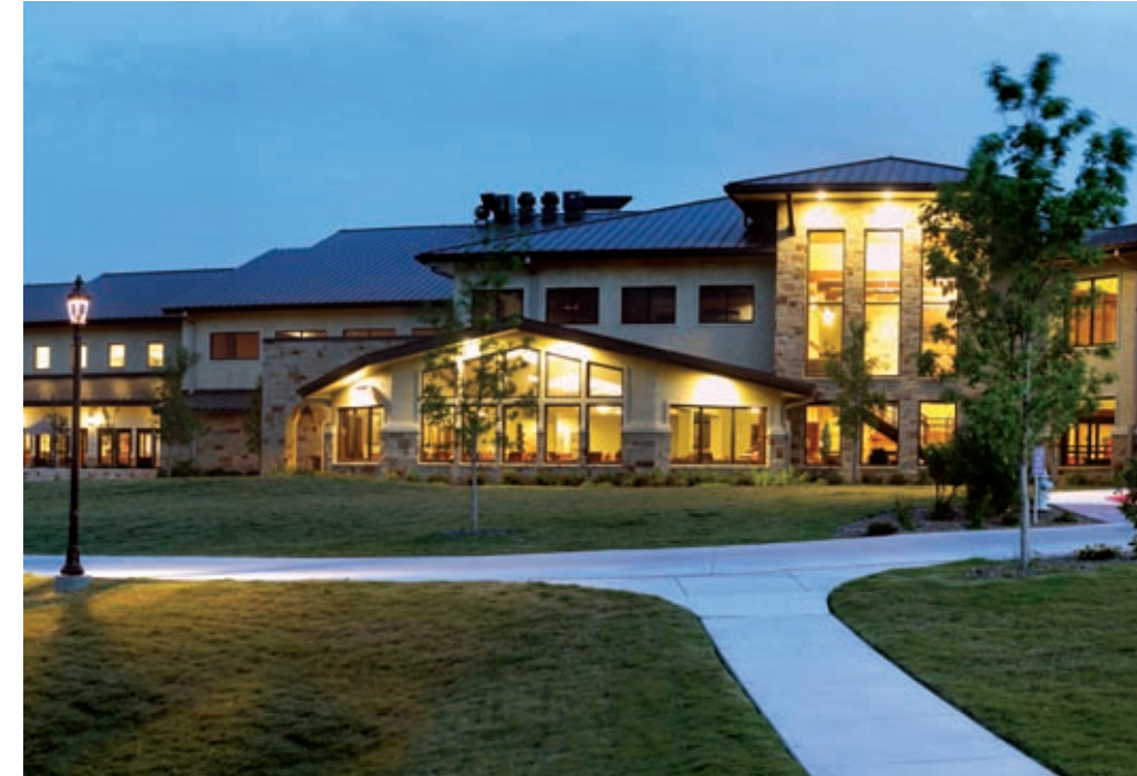
ARMY RESIDENCE COMMUNITY