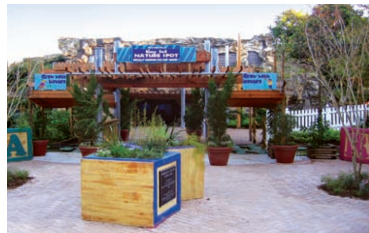
SAN ANTONIO ZOO – TINY TOT NATURE SPOT