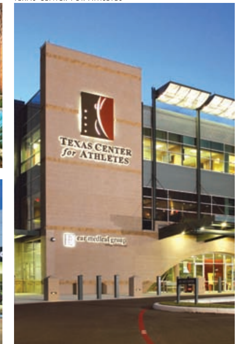
TEXAS CENTER FOR ATHLETES