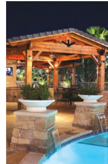
PALOMINO APARTMENT HOMES