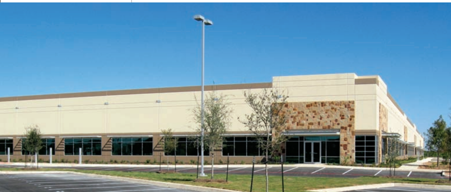
WESTPOINTE CORPORATE CENTER

Situated on 12.5 acres in San Antonio, the project consists of a 114,180-square-foot, single-story, tilt-wall shell, mixed-use office/industrial building with site work.