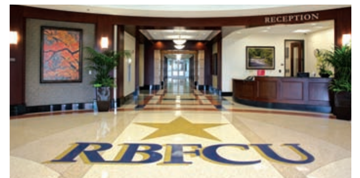
RANDOLPH BROOKS FEDERAL CREDIT UNION HEADQUARTERS

RBFCU Headquarters Two four-story administrative office facilities are home to more than 500 Randolph Brooks Federal Credit Union employees. The campus includes a five-story parking garage, auditorium and cafeteria.