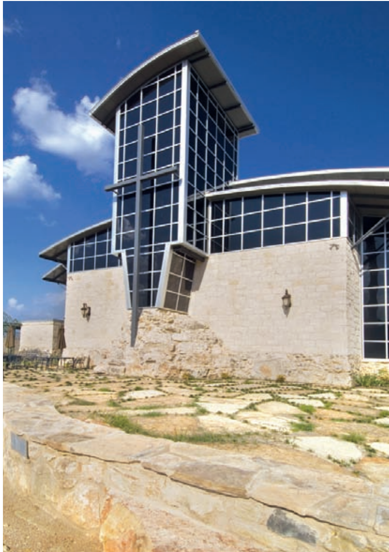
FELLOWSHIP OF SAN ANTONIO

Fellowship of San Antonio is located in the Stone Oak area. This church/school facility includes a worship center, classrooms, gymnasium and administrative offices for a growing congregation.