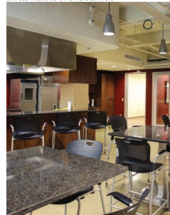
C.H. GUENTHER & SON, INC. HEADQUARTERS